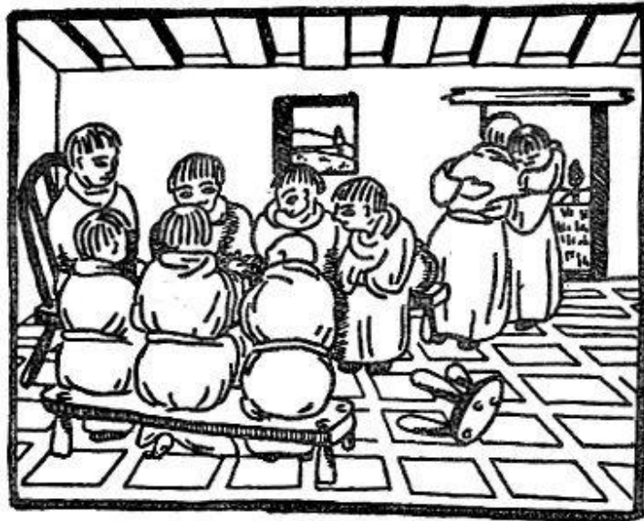
The meeting hostile to St. Columcille