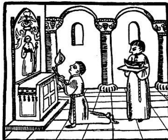
The two clerks offering the leaf at St. Columcille's altar