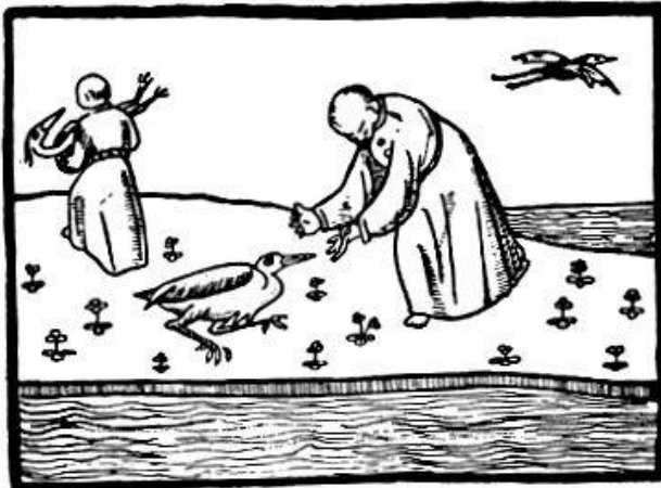
The Crane from Ireland